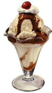
an ice cream